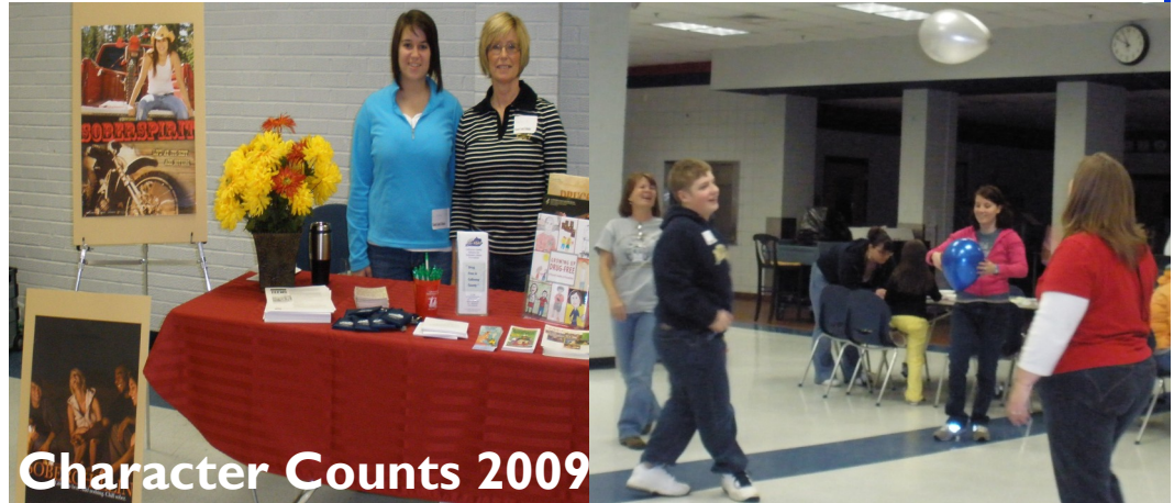
Character Counts 2009